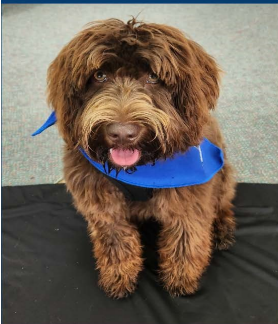
Daphne our well being dog will be on site this term!