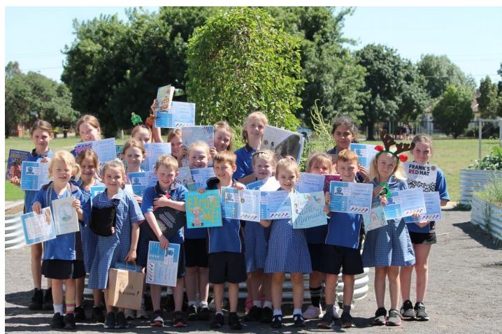
Pictured above are our Student of the Term! Well done to you all on an excellent term.