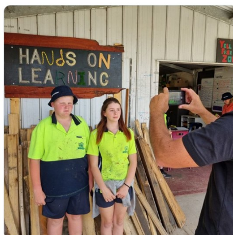
Jason Clare MP and 5 others

Starring bright Benalla P-12 College on day 3 of our @handsonlearn national Student Celebration! The student hosts highlighted their favourite projects, a pizza oven, chicken enclosure, a greenhouse & timber community benches that will be donated to the Tomorrow Today Foundation.