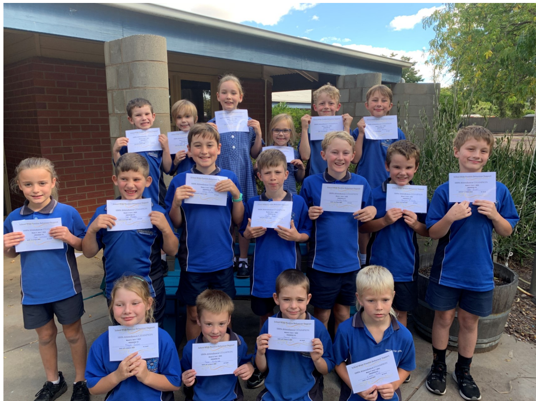
Attendance winners for week 8 and week 9