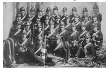
Benalla Mechanics' Brass Band 1899