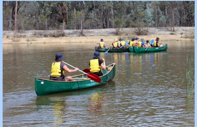
STUDENTS LEARN HOW TO FORM A RAFT WITH THEIR CANOES