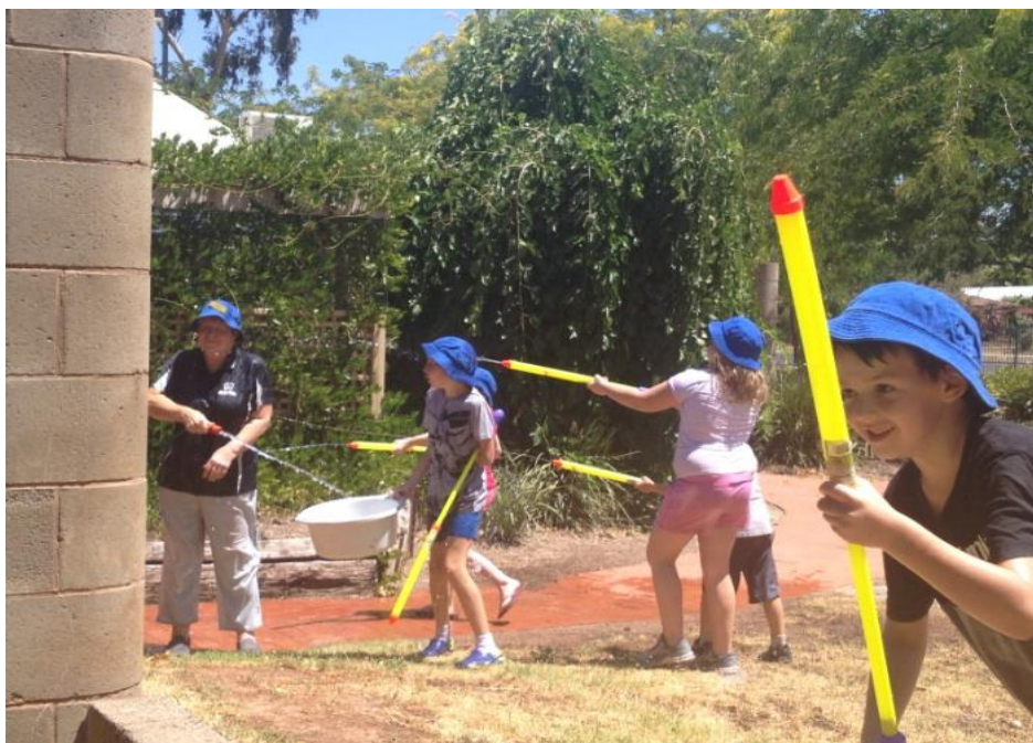
Water activities were a huge hit with students and Staff during Vacation care.

What a wonderful but hot Vacation Care we had! The kids were fantastic during the holidays. We had lots of inside activities to keep the children entertained and cool. The activities enjoyed consisted of movies, swimming, Shepparton bowling, cooking and much more. We had many different activities that the children loved! Children participated in many craft activities, taking home their precious creations. Thanks to parents that were understanding about inside activities and cancelling a pool day. We could not go without the support of our wonderful staff! Thank-you!