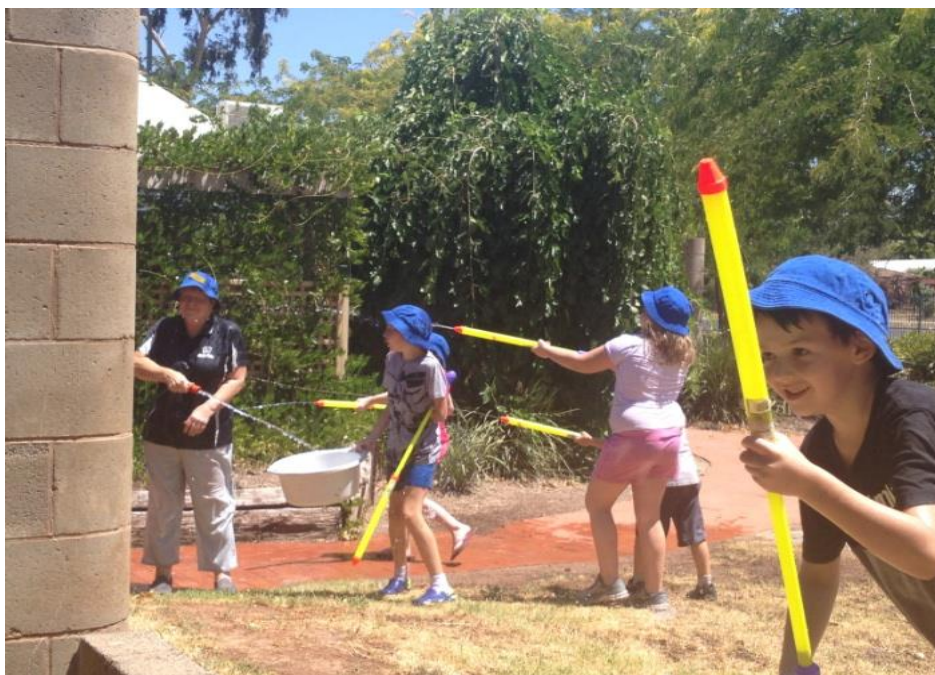
Water activities were a huge hit with students and Staff during Vacation care.

What a wonderful but hot Vacation Care we had! The kids were fantastic during the holidays. We had lots of inside activities to keep the children entertained and cool. The activities enjoyed consisted of movies, swimming, Shepparton bowling, cooking and much more. We had many different activities that the children loved! Children participated in many craft activities, taking home their precious creations. Thanks to parents that were understanding about inside activities and cancelling a pool day. We could not go without the support of our wonderful staff! Thank-you!