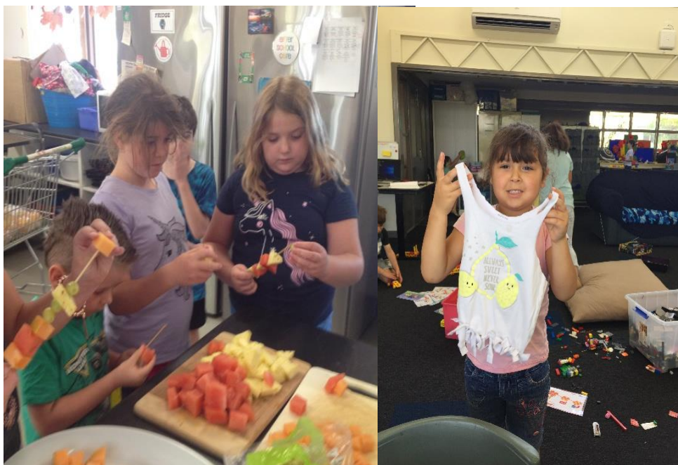
Making fruit skewers and T-shirt decorating were creative indoor activities we used to escape the summer heat.

To view the activities and afternoon tea menu, click on the following link: https://benallap12.vic.edu.au