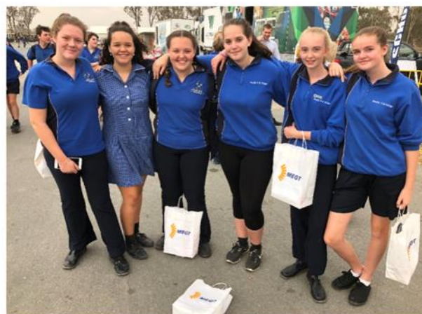
Hands on Trades Day – Winton Raceway

On Thursday the 3 rd of May we took all of our Year 9, 10 and VCAL students to Winton Motor Raceway to participate in the Hands on Trades Day.