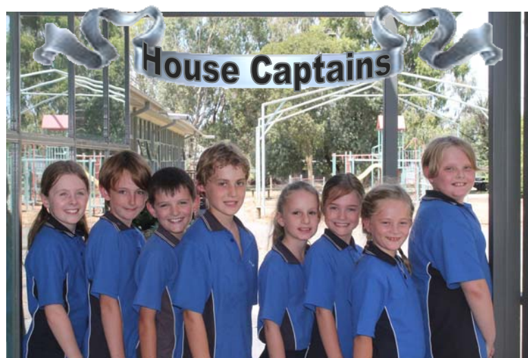
This years house captains are from L-R